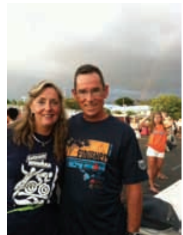
Iron Friar in his Finisher Shirt with his Sister in Hawaii!

Total time: 15 hrs, 37 min, 11 sec. Swim: 1 hour 23 min. 27 Sec. Bike: 8 hours 8 min 58 sec. Run: 5 hours 42 min. 48 Sec. Rank: 53rd in his group Overall: 1802